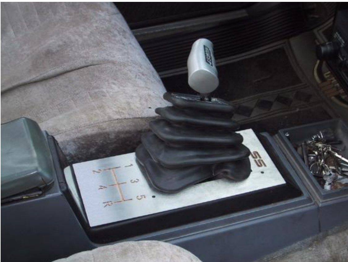
A T-Bar shifter on a manual

Is T-Bar shifter only used for cars with automatic transmission? No. T-bar shifter can be used for both manual and automatic, some drivers like it on manual some drivers don't.